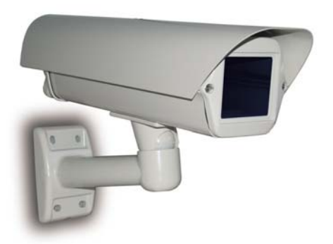
External slot forVega Wireless Camera